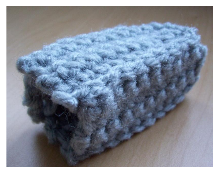
20. Sew this rectangle piece to the front of the cab. See photo.