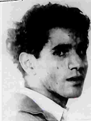
SIRHAN BISHARA SIRHAN, male, Arab, born 3/19/41 Jerusalem, 5'3", 120 #, brown hair, brown eyes