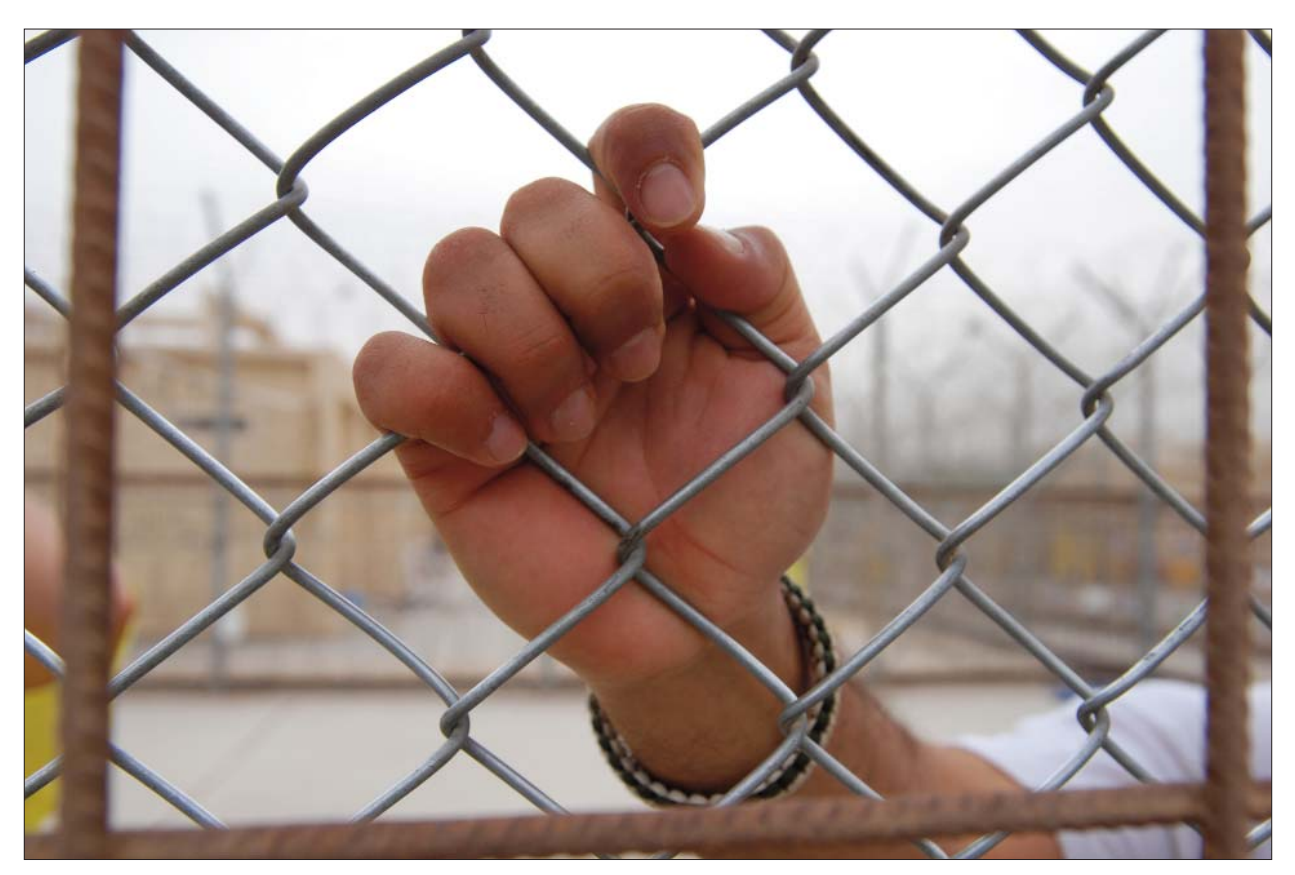
Prisoners grips fence at Camp Cropper, the main U.S. detention facility in Baghdad.

hen U.S. troops or embassy officials want to track and investigate Iraqis—such as interrogating those accused of terrorism, doing background checks on potential employees, or even to chat with ordinary citizens on the street—the principal intermediary is a relatively obscure company named L-3, that is just over a decade old. Although it is not as well known as companies such as Halliburton, it is now the ninth-largest private military and security company