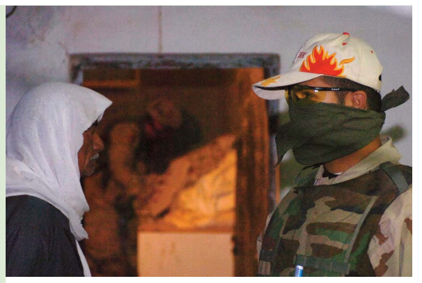
During a night raid, an unnamed interrupter works with U.S. troops questioning an Iraqi citizen while U.S. troops search an IED cell leaders home near Tikrit, Iraq.