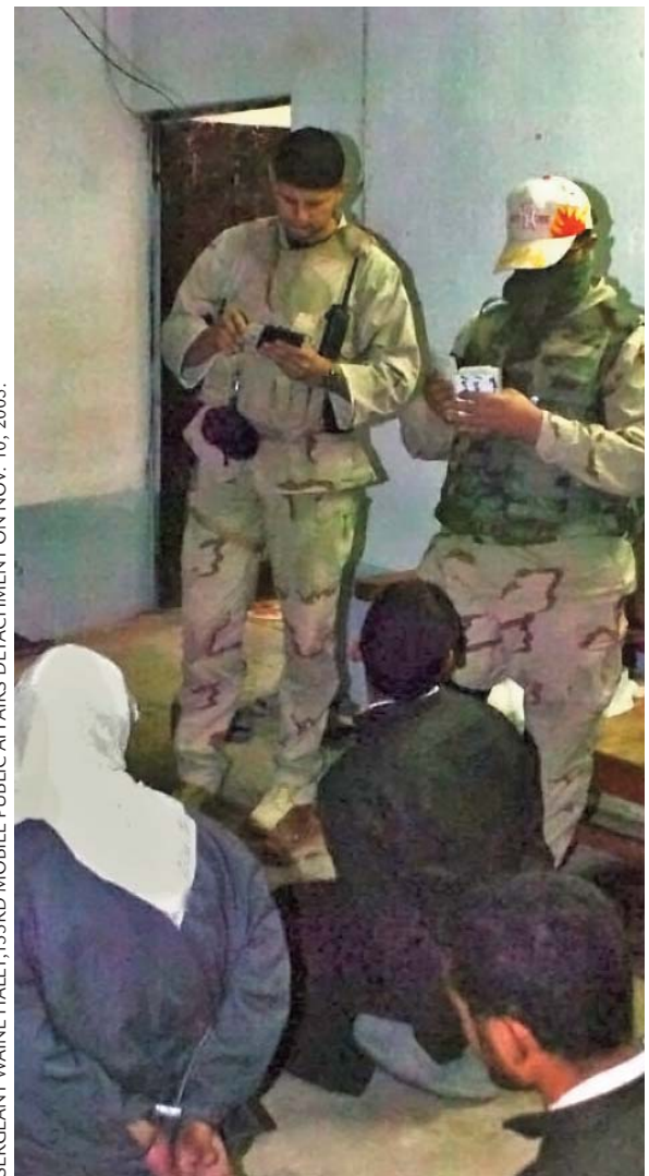
Titan translator and soldier on night raid in Tikrit.

Cover Photo: Prisoners working at Camp Cropper, the main U.S. detention facility in Baghdad, April 3, 2008.