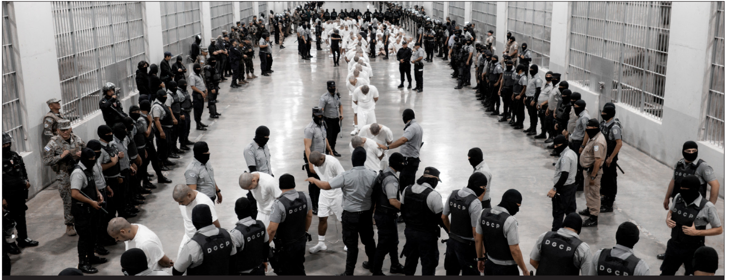
Salvadoran police officers escort alleged members of a Venezuelan gang (read – migrant workers) recently deported by the USA to the Terrorism Confinement Centre concentration camp 'prison' in Tecoluca, El Salvador. The USA has presented no evidence to back up its claims that these migrants are criminals.