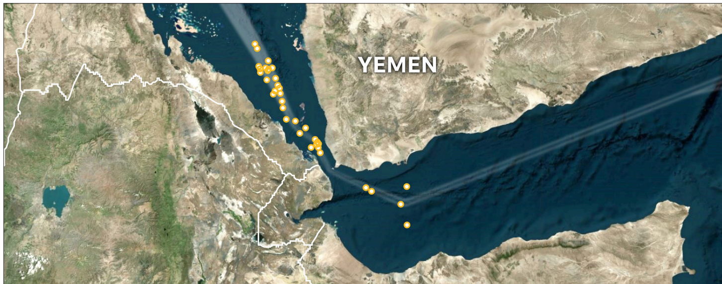
A map showing the Bab al-Mandab strait at the entrance to the Red Sea, a key shipping route. At just 16 miles wide, it has been crucial in Yemen's courageous anti-imperialist and anti-zionist struggle in support of Palestinian liberation.