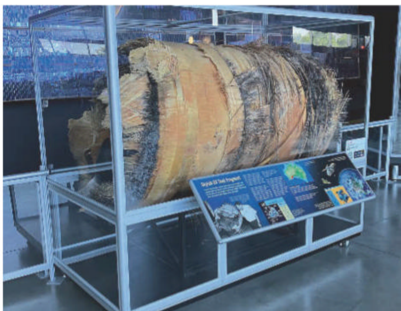
After its deorbit, chunks of the Skylab station were found on land (left). The Mir station (below) burned up and splashed down into the Pacific Ocean

On Earth, microbes can be used to extract rare earth metals that are vital to modern technologies, but scientists assumed gravity was integral to the process. In 2020, however, data from ISS experiments found at least one microbe, Sphingomonas desiccabilis , can leach rare earth elements just as well in microgravity. Biomining could be a way to harvest materials for human settlements on future lunar or Martian bases.