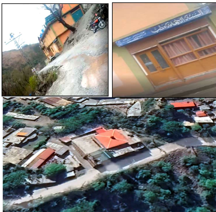
Markaz Syedna Bilal