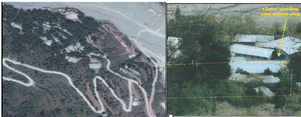
Shawai Nallah Camp.