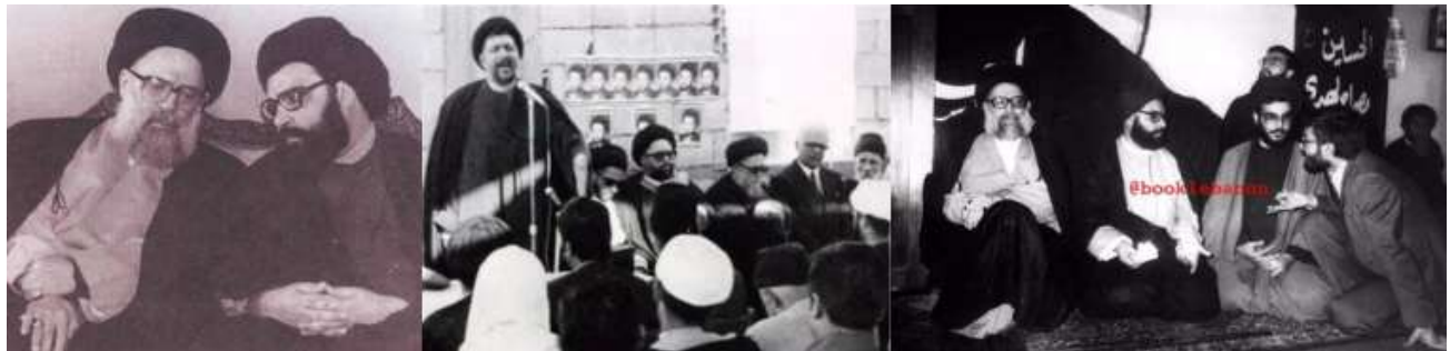
left to right: Sayyed Fadlallah & Sayyed Abbas al-Mousawi; Sayyed Fadlallah (second one to the right) behind Imam Musa Sadr; Sayyed Fadlallah, Sayyed Abbas al-Mousawi, & Sayyed Hassan Nasrallah

Sayyed Fadlallah was one of the most prominent faces of the Resistance, which was at its rise in Lebanon at the time. He played a major role in strengthening the Resistance against "israel" in several aspects and was thus at the top of the list of American targets.