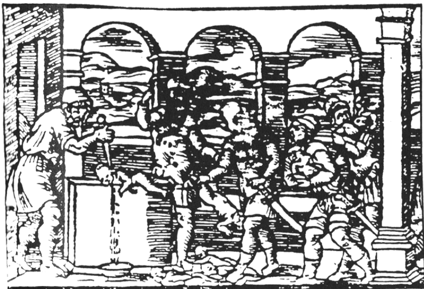
Fig. 5. The Pharaoh's Bath of Blood , woodcut from the Passover Haggadah, Mantua, Giacomo Rufinelli, 1560 (detail).