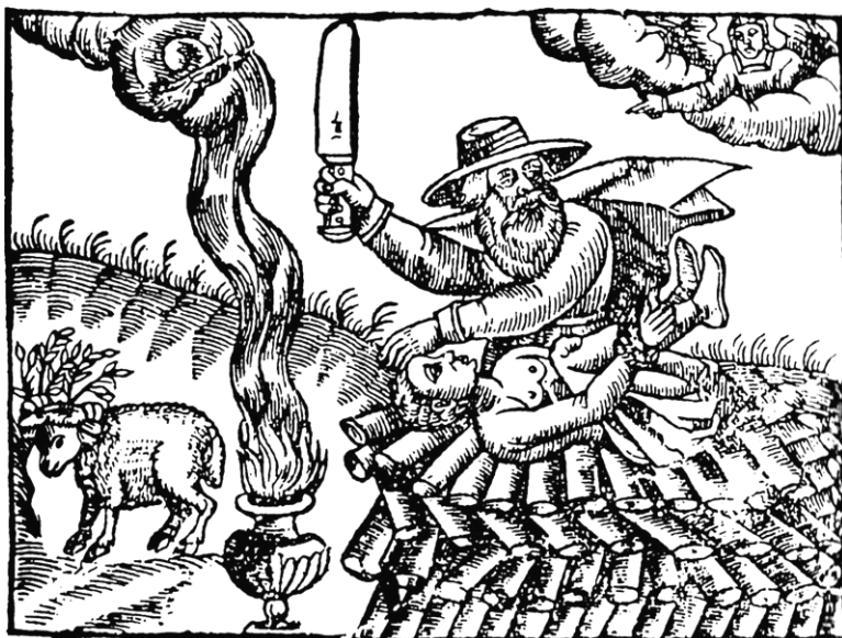
Fig. 15. Sacrifice of Isaac , woodcut from the Ritual Responsals (Sheelot w-teshuvot) of Asher b. Yechiel, Constantinople, without publisher, 1517.