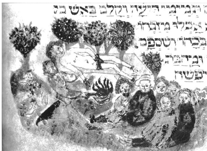
Fig. 14. German Jew Tortured with Fire , miniature from Jewish Code 37 from the Hamburg State and University Library (c. 79r).