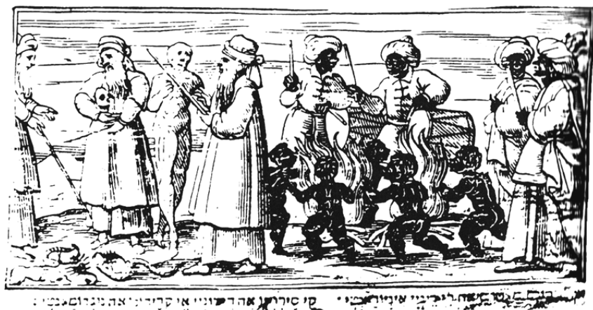
Fig. 7. Enchanters and Necromancers , woodcut from the Passover Haggadah, Venice, Giovanni De Gara, 1609.