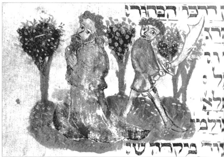
Fig. 13. German Jew Being Executed with a Sword , miniature from Jewish Code 37 from the Hamburg State and University Library (c. 79r).