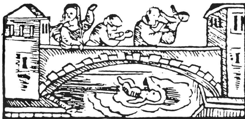
Fig. 8. Children Drowned in the Nile , woodcut from the Passover Haggadah, Prague, Gershom Cohen, 1526.