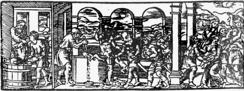
Fig. 4. The Pharaoh's Bath of Blood , woodcut from the Passover Haggadah , Mantua, Giacomo Rufinelli, 1560.