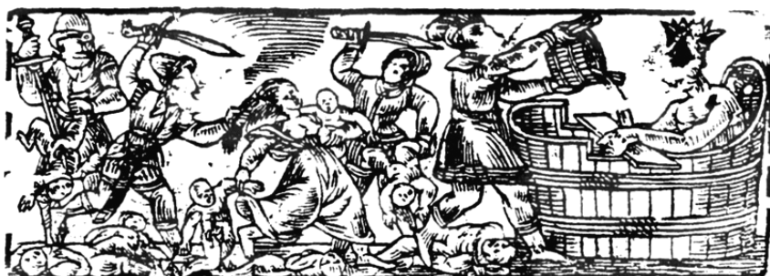
Fig. 2. The Pharaoh's Bath of Blood , woodcut from the Passover Haggadah , without publisher, circa 1580.

פרעם אין יידן קינדער בלוט ער האט גיבארן : גאט און מוילדע בלוט נישט און גראסן וויל לאזן