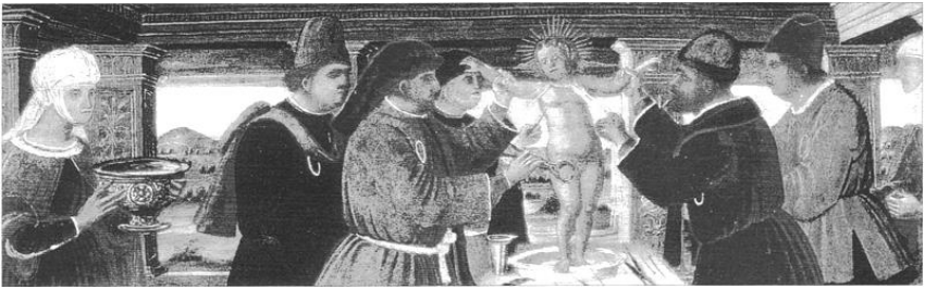
Fig. 20. Gandolfino da Roreto d'Asti, Martyrdom of Simonino , tempera on wood, end of 15th century, Jerusalem, Israel Museum.