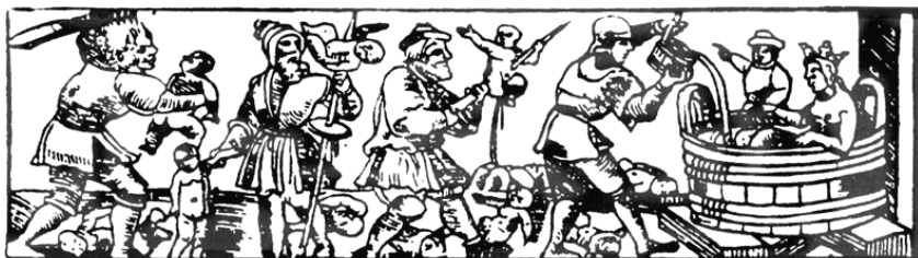
Fig. 1. The Pharaoh's Bath of Blood , woodcut from the Passover Haggadah , Prague, Gershom Cohen, 1526.

פרעם אין יידן קינדער בלוט ער האט גיבארן : גאט און מוילדע בלוט נישט און גראסן וויל לאזן