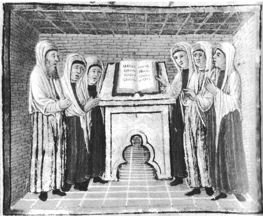
Fig. 22. Oratory of German Jews with the “almemor”, miniature from the Rothschild Miscellany , Venice (?), 1475, Jerusalem, Bezalel Museum.