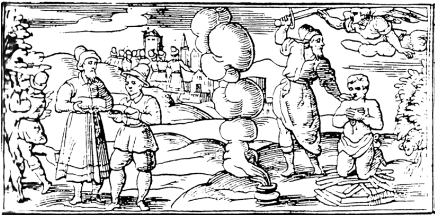
Fig. 12. Sacrifice of Isaac , woodcut from the Passover Haggadah, Venice, Giovanni De Gara, 1609.