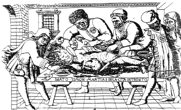
Fig. 16. Martyrdom of Simonino and Jews with Eyeglasses , woodcut, Northern Italy 1475-85 (from A.M. Hind, Early