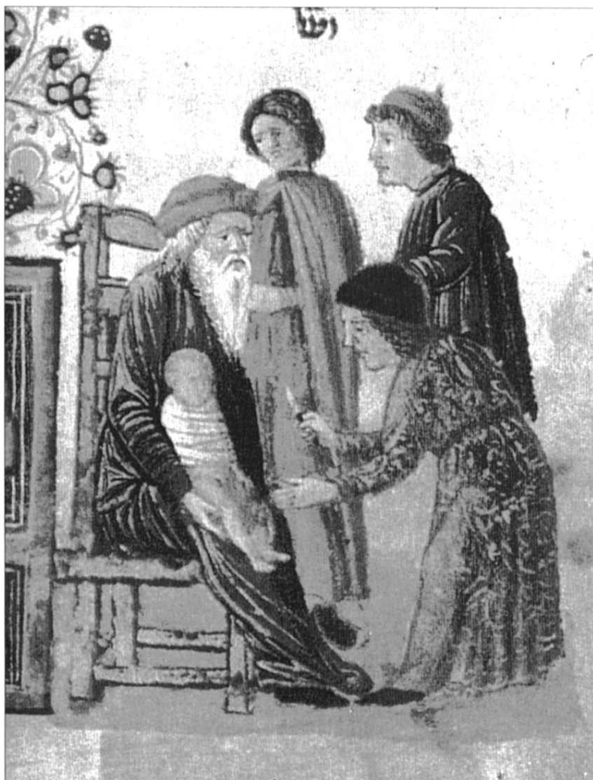
Fig. 17. Circumcision , miniature from the Rothschild Miscellany , Venice (?), 1475, Jerusalem, Bazelel Museum.