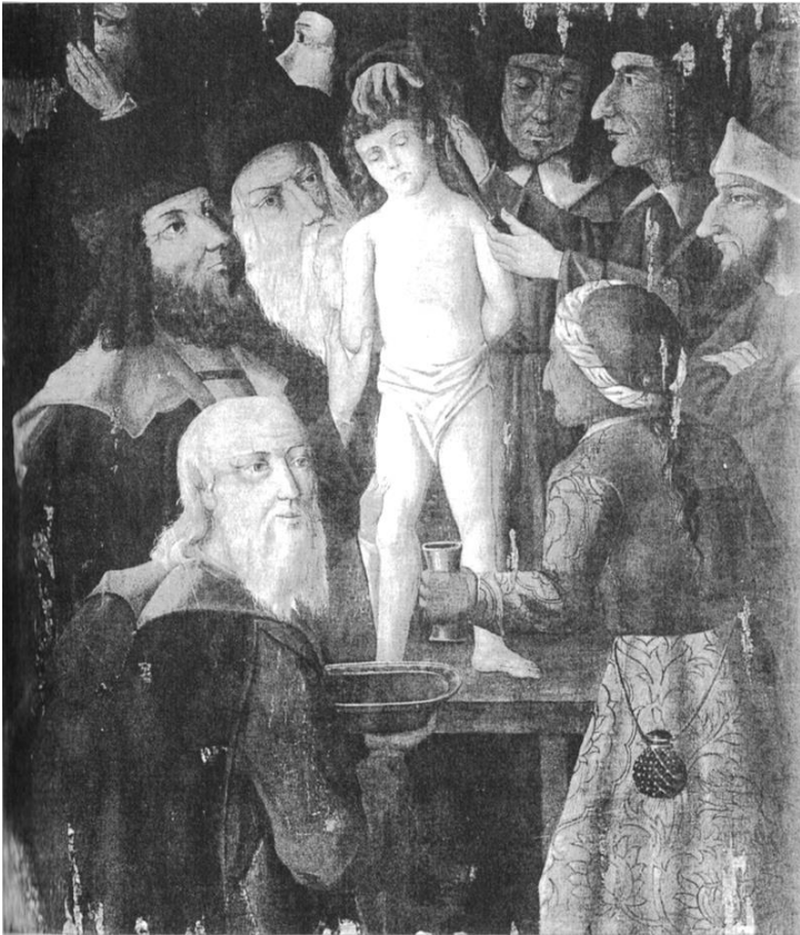
Fig. 21. Alto Adige School, Martyrdom of Simonino , first half of