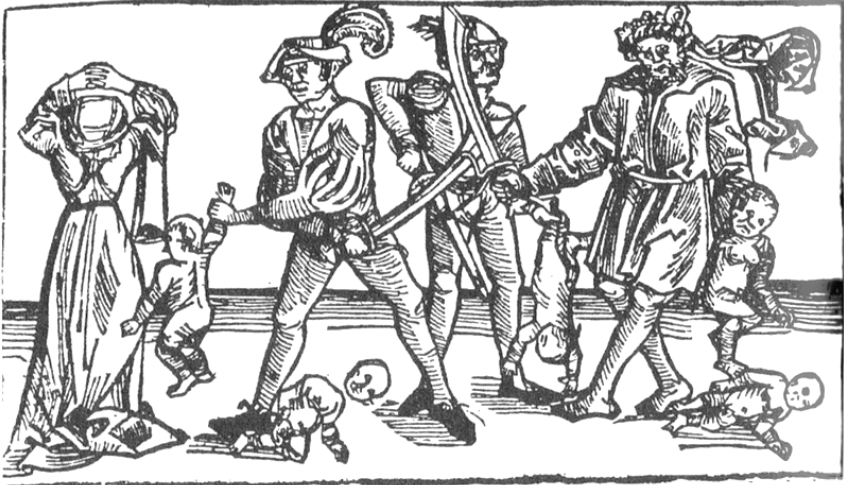
Fig. 3. The Massacre of the Innocents , woodcut from the Ultraquist Passional , Prague, Jan Camp, 1495.