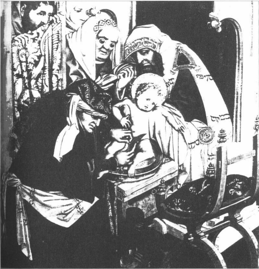
Fig. 19. Circumcision of Christ , altar piece, circa 1450, Nuremberg, Liebfrauenkirche.